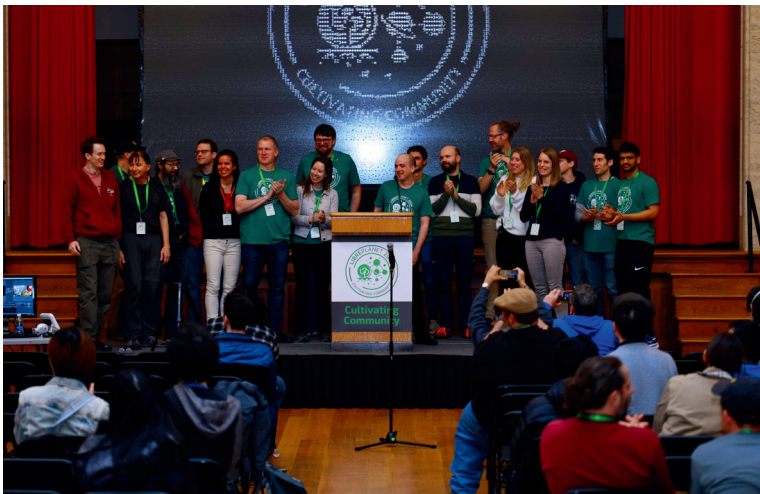
FSF staff and volunteers at LibrePlanet 2024.

Linux in 1997, testing and using several distributions until I became familiar with the concepts of free software. Most of the upstream distributions did not emphasize full user freedom, but only partial freedom. When I found out in the 2000s that a project from my country called Ututo had been released and recognized as 100% libre, I was very excited. It took some time before I could decide to do something of my own. At that time, I was unemployed and a brother of mine motivated me to do it. I didn't know exactly how I was going to do it, but I knew that I had gained experience since then and wanted to learn more, with the intention from start to finish to make something 100% libre that respected the user's freedom. Instead of making a derivative distribution and saving myself a lot of work, I decided to start