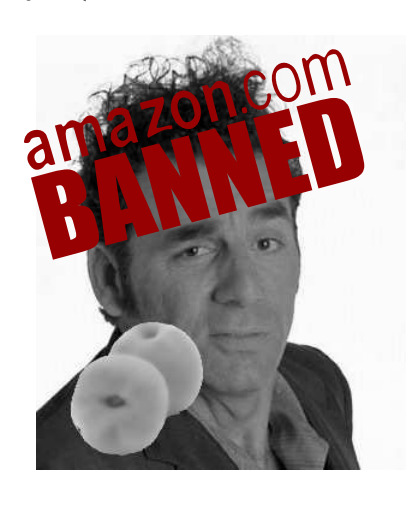
"This peach is sub-par"

Please do write to us at info@defectivebydesign.org about anything you do to protest ebook DRM, and use the LibrePlanet wiki at libreplanet.org to share the texts and reading lists you've created. Together we can achieve the same in the arena of ebooks that we have achieved in music — a widespread recognition that people will no longer tolerate DRM.