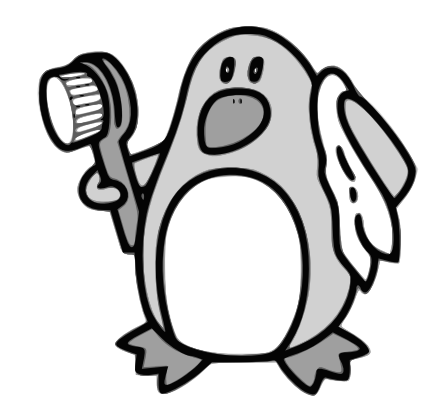
Freedo, the mascot of Linux-libre

a requirement for learning to value one's own freedom, and to respect others', for then there's hope some day we can all "Be Free!" 💝